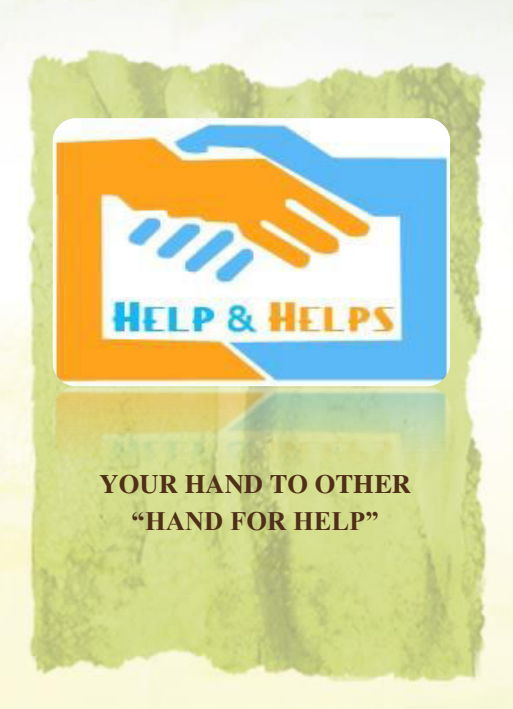
"Come and join us to help ours"