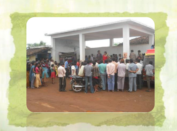
Nukkad Natak Activity for AIDS awareness

A Project of NACO CSM, it was a project to promote condoms for safety of human life by the threat of HIV/AIDS diseases. We reached 448 blocks including cities, to promote condom use and safe life, with all information of AIDS, STI and family planning. We aware with designed TV shows, pamphlets, audio jingles, Anchoring, games etc...It was memorable with Pashupati Chemicals and Pharmaceuticals Limited who join hands with us. We aware more than 2, 00, 000 people and shows to make secure life as "Prevention is cure for AIDS". Our Road Show Activity was started from 01-02-12 and completed on 17-05-12.